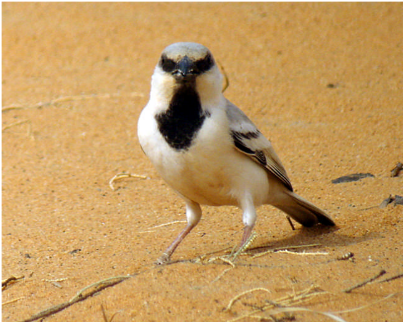
Male Desert Sparrow Auberge Yasmina, Erg Chebbi 11 th April.